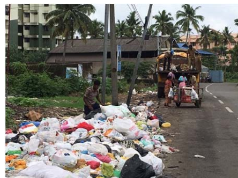
Fig. 2. Collection and segregation of MSW