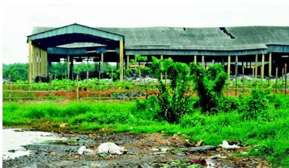
Fig. 6. Existing treatment plant