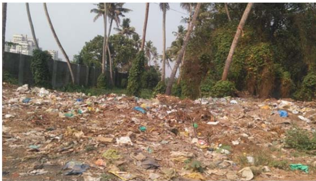
Fig. 5. Dumping site