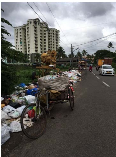
Fig. 3. A tricycle used for MSW