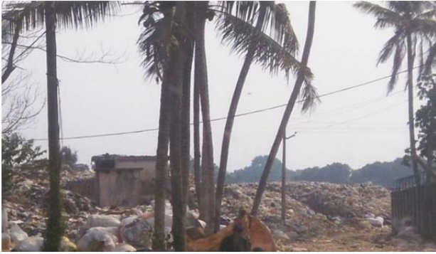
Fig. 4. Open dumping of waste outside the plant